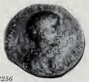
Lot No. 2256

Annius Verus and Commodus. Æ 29. Draped and bare-headed bust of Annius Verus l. Rv. Draped and bare-headed bust of Commodus as a boy. Gnecchi Pl.151.8. Dark brown-black patina, pitted. Very Good. Extremely rare. (700–900)